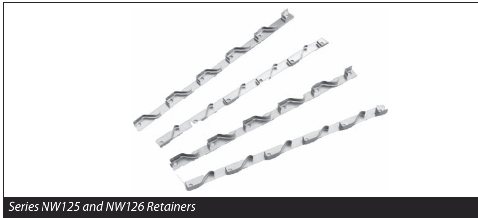
Series NW125 and NW126 Retainers