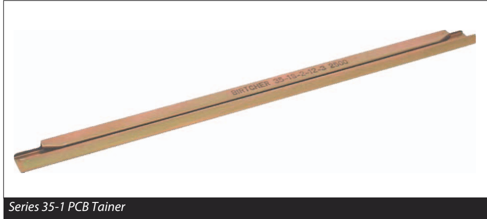
Series 35-1 PCB Tainer